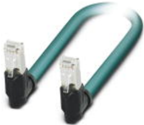
Patch cable, CAT5e, 4-pair, shielded, line, assembled at both ends with angled RJ45/IP20 heads, length: 5 m

Please be informed that the data shown in this PDF Document is generated from our Online Catalog. Please find the complete data in the user's documentation. Our General Terms of Use for Downloads are valid ( http://phoenixcontact.com/download )